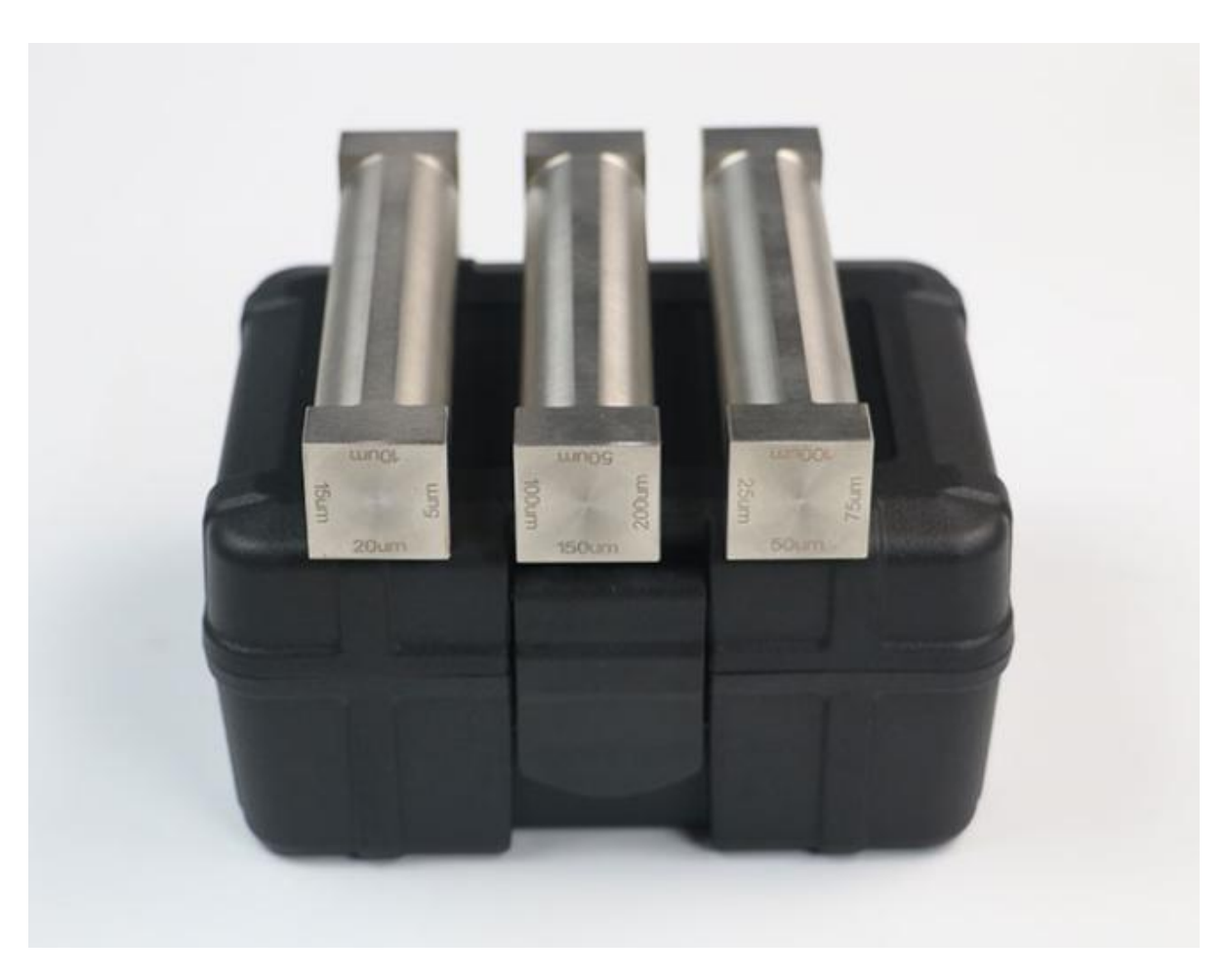
(Packing for your reference only)